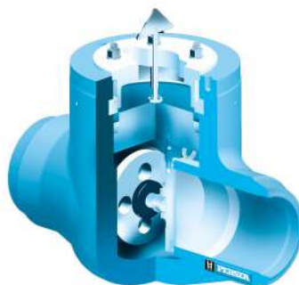
LINE BLIND VALVES