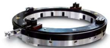
HEAVY LIFTING TECHNOLOGY