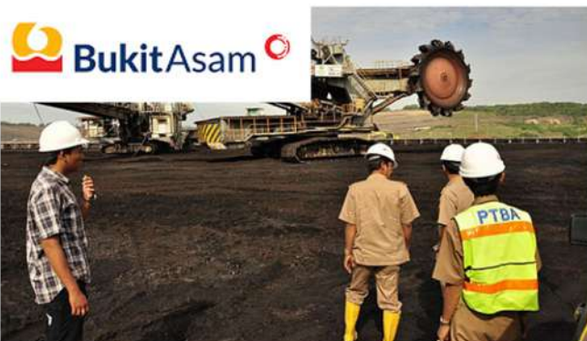
PT. Bukit Asam Tbk