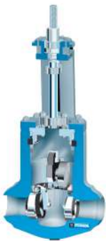
STOP CHECK VALVE