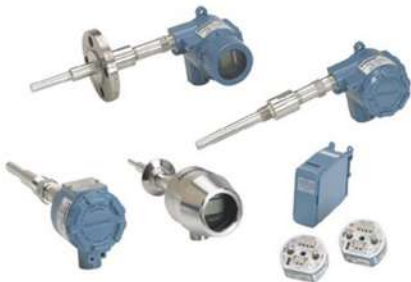
ROSEMOUNT 644 TEMPERATURE TRANSMITTER

Rosemount proudly provides the broadest array of pressure measurement products for pressure, flow, and level applications. Rosemount leverages years of industry knowledge and experience to offer increased plant efficiency and safety at lower installed cost. Whether your application is critical control, safety, or monitoring, there is a Rosemount pressure product that best meets your needs.