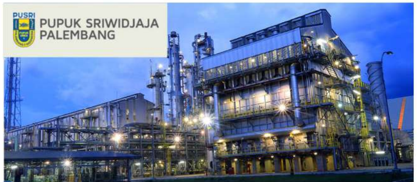
PT. Pupuk Sriwidjaja Palembang (Pusri)