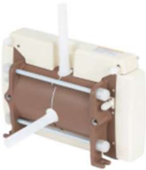
PNEUMATIC DRIVE BELLOWS PUMPS