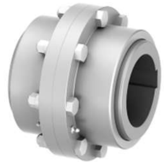
GEAR COUPLINGS TNZ