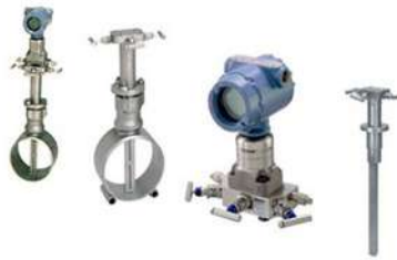
ROSEMOUNT 3051SFA PROBAR FLOW METER