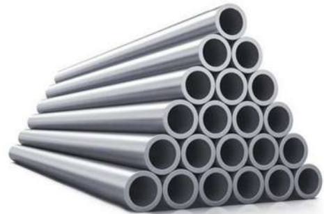
254 SMO PIPES