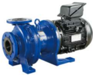
MAGNETIC DRIVE PUMPS

High production capacity despite having a wide array of products to meet the diverse needs of customers is one of the reasons Iwaki is known as one of the world's leading manufacturers.