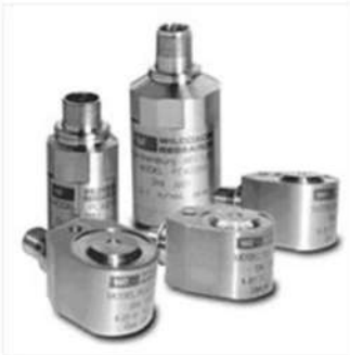
VIBRATION SENSORS (4-20MA)

Wilcoxon Sensing Technologies , an ISO 9001:2015 vibration monitoring solutions manufacturer and supplier, has set the industry standard for machine vibration monitoring products since the 1960's. Whether you are purchasing a few, hundreds, or even thousands of vibration sensors, Wilcoxon is your one stop shop for vibration monitoring products including accelerometers, 4-20mA sensors, velocity sensors, IP67 and IP68 cable assemblies, mounting devices, portable vibration meters, vibration transmitters, intrinsically safe enclosures, junction boxes, hydrophones, vector sensors, seismic accelerometers, underwater sensors, and more.