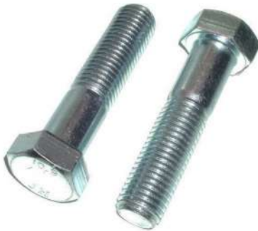
254 SMO FASTENERS