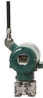
WIRELESS DIFFERENTIAL PRESSURE/ PRESSURE TRANSMITTERS