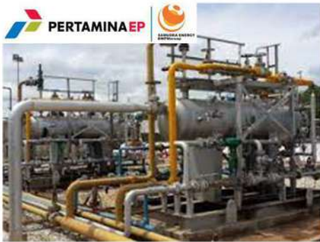
(KSO) PT. PERTAMINA EP – PT. SAMUDRA ENERGY BWPMeruap