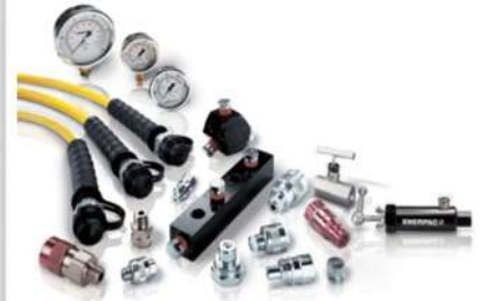
FLANGE MAINTENANCE TOOLS