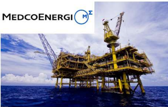
Medco E&P Natuna Ltd.