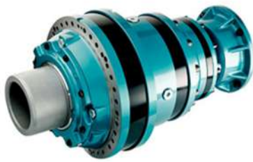
HIGH TORQUE PLANETARY GEARBOXES

Brevini has a long history and it was among the world's top ten manufacturers in the sector of mechanical transmissions and gear drives, thanks to relevant market shares in industrial applications (steel industry, plastics production, materials handling) and in innovative systems such as waste recycling plants, wind and energy production. Brevini name was related to a major player also in the mining sector and in marine technologies.