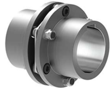
STEEL DISC COUPLINGS TND