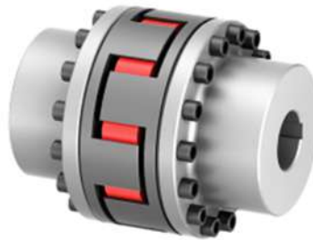
ELASTOMER JAW COUPLINGS TNS