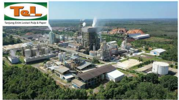
PT. TanjungEnim Lestari Pulp and Paper