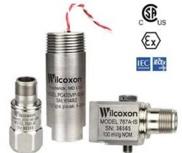
HAZARDOUS AREA SENSORS