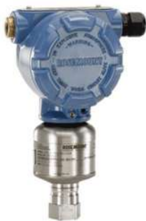
ROSEMOUNT 3051SAM ERS TRANSMITTER