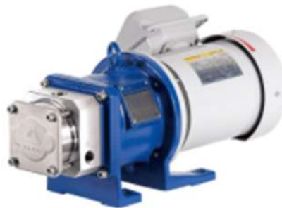
ROTARY DISPLACEMENT PUMPS