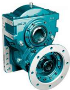
SHAFT MOUNTED GEARBOXES