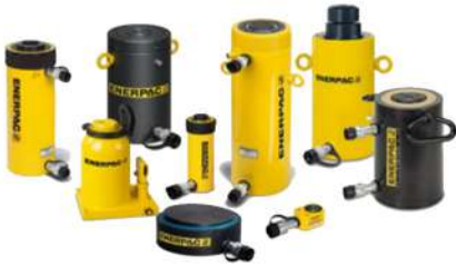
CYLINDERS & JACKS

Enerpac combines technical excellence with proven performance – every day, every year, year after year. We believe that customers shouldn't have to compromise – they can rest easy knowing that even in the most complex situations, their reputations and productivity are protected by the most trusted industrial tools and services available.