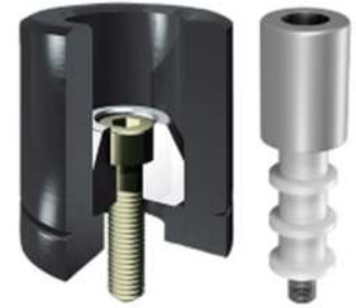
SHOCK ABSORBING ELEMENTS