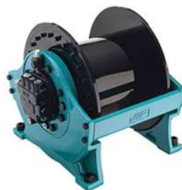
HOISTING & RECOVERING WINCHES