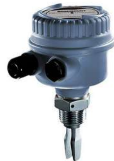
ROSEMOUNT 2120 LIQUID LEVEL SWITCH