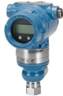
ROSEMOUNT 3051T PRESSURE TRANSMITTER