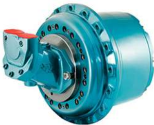
MOBILE PLANETARY GEARBOXES