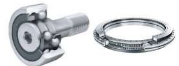
OTHER ROLLER BEARINGS