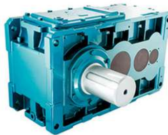
HELICAL AND BEVEL HELICAL GEARBOXES