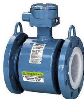
ROSEMOUNT 8707 HIGH SIGNAL MAGNETIC FLOW METER SENSORS