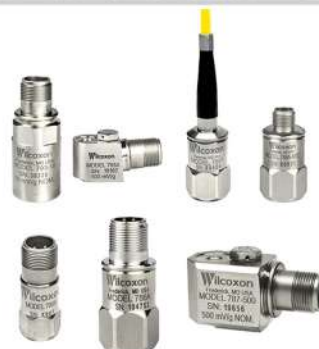
VIBRATION SENSORS (IEPE)