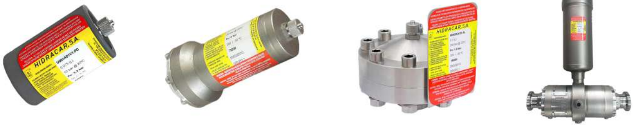
HIDRACAR PULSATION DAMPERS

Since 1974 HIDRACAR S.A. manufactures pulsation dampers, oil-pneumatic accumulators and related equipment for application in all types of industries. HIDRACAR S.A. is a leader in the field of pulsation dampers, oleo-pneumatic accumulators, shock absorbers, oleo-hydraulic starters for diesel engines and oleo-pneumatic suspensions for agricultural tanks and trailers.