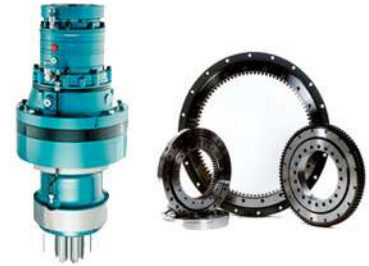
SLEWING DRIVES & SLEWING RINGS