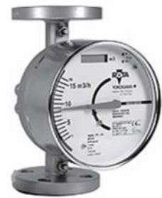
YOKOGAWA RAMC SHORT STROKE ROTAMETER