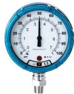
ROSEMOUNT SPG SMART PRESSURE GAUGE