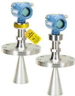
ROSEMOUNT 5408 RADAR LEVEL TRANSMITTER