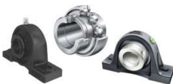
RADIAL INSERT BALL BEARINGS & HOUSING UNITS