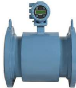
ROSEMOUNT 8750W MAGNETIC FLOW METER