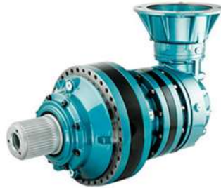
INDUSTRIAL PLANETARY GEARBOXES