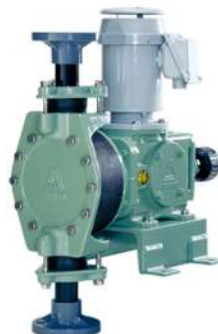
MECHANICALLY-DRIVEN DIAPHRAGM METERING PUMPS LK SERIES