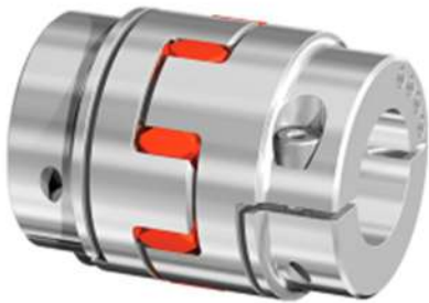
ELASTOMER JAW COUPLINGS