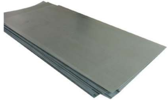
254 SMO PLATES