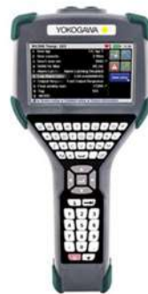
YOKOGAWA YHC5150X PORTABLE HART COMMUNICATOR