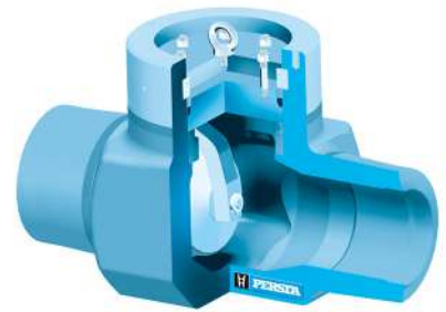
SWING CHECK VALVES