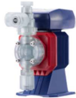
ELECTROMAGNETIC METERING PUMPS