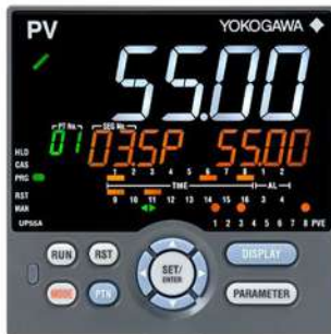
YOKOGAWA UP55A PROFILE CONTROLLER