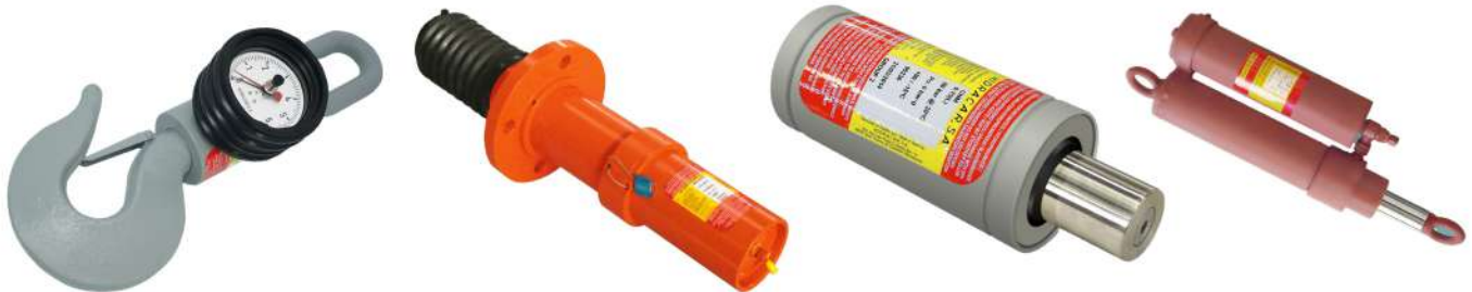
HIDRACAR FOR INDUSTRY