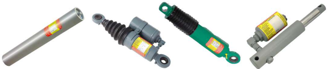
HIDRACAR FOR AGRICULTURE