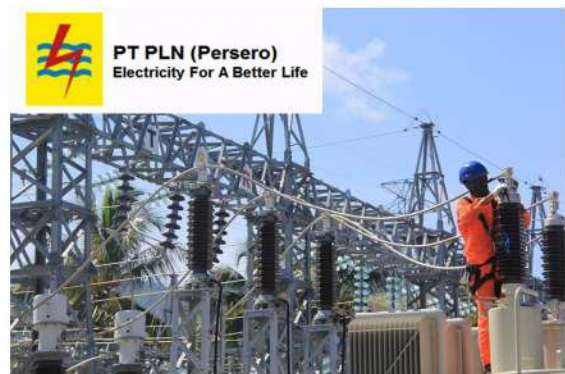
PT. PLN (Persero)