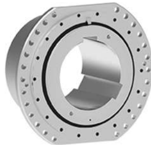
BARREL COUPLINGS TNK