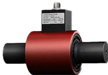
TORQUE MEASURING SHAFT