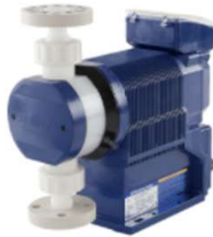
MOTOR DRIVEN METERING PUMPS