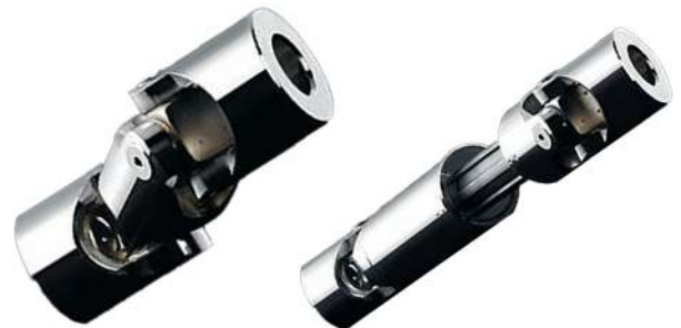
PRECISION JOINTS / CARDAN SHAFTS