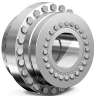
FLANGE COUPLINGS TNF