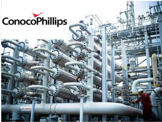
ConocoPhillips (Grissik) Ltd.