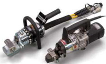
PORTABLE MACHINE TOOLS