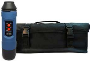
VIBRATION REFERENCE SOURCES