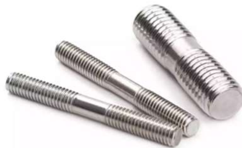
CUSTOMIZE 254 SMO