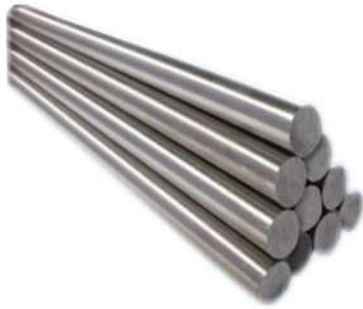
254 SMO ROUND BAR