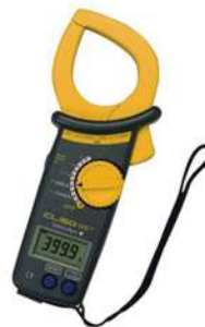
YOKOGAWA CL150 CLAMP-ON TESTER