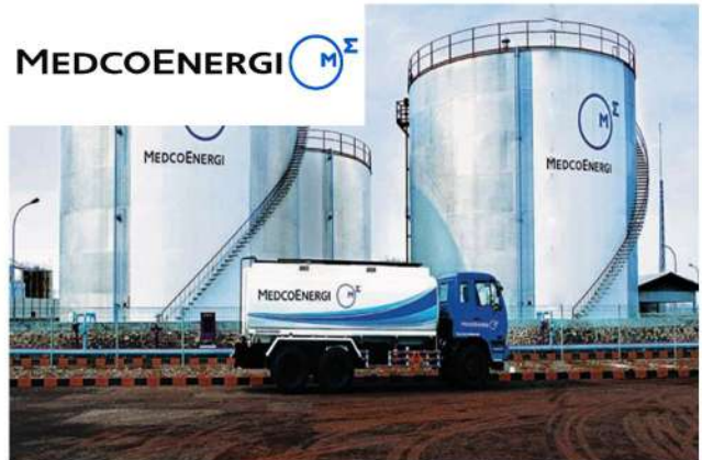
PT. Medco E&P Indonesia